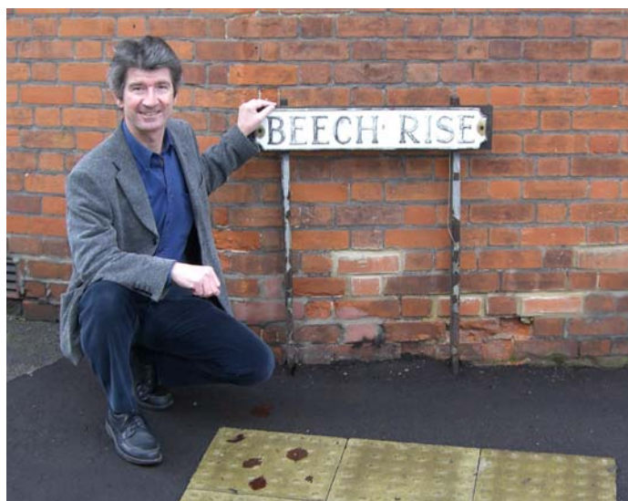
Below: Beech Rise dropped kerbs